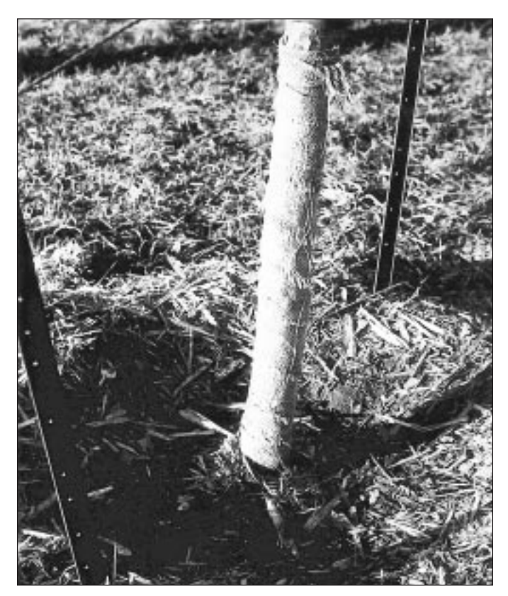
Loosely wrapped and secured with rope, burlap protects trees from extreme temperatures.

Hardware cloth protects trees from animals and equipment, but it doesn't protect them from weather. Place the hardware cloth around the tree, but not touching it. The bottom of the wire should extend five