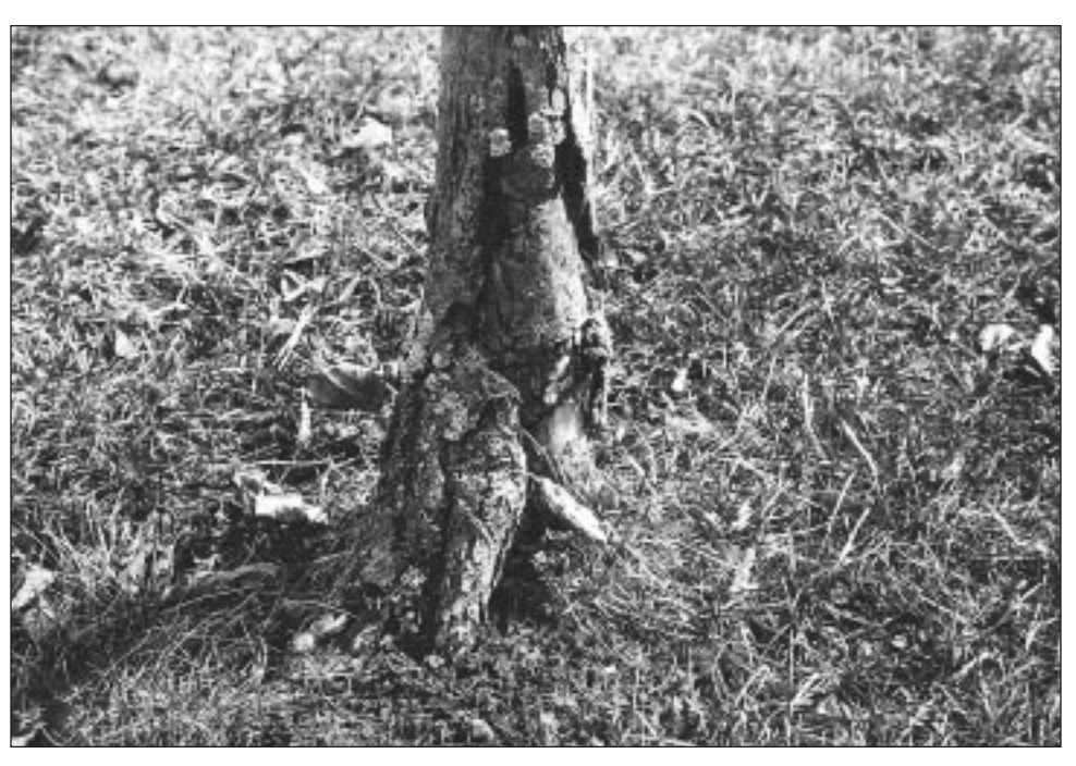
Grass trimmers and lawn mowers can damage the bark and cambium of trees.

Careless use of lawn mowers, weed trimmers and other equipment can damage tree trunks. Some guards reduce the risk of this kind of damage by protecting trees from abrasion and making them easier to see.