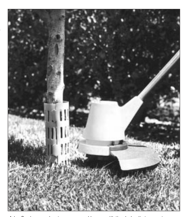
ArborGards expand as trees grow and have ventilation holes that prevent moisture buildup.

Spiral Guards are plastic strips that can be wrapped around tree trunks. They protect trees from weather damage, and animal browsing. Ventilation holes allow the trunk to