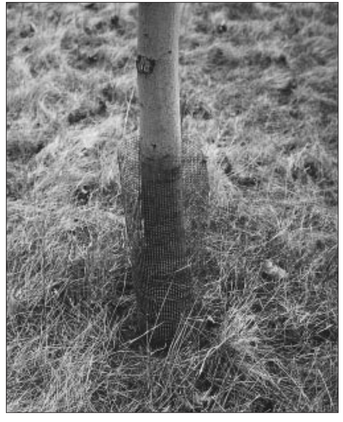
Hardware cloth protects trees from voles and other small mammals.