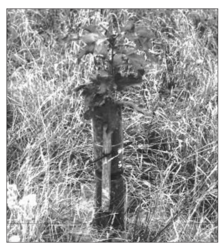
A stack of four plastic pop-bottles protects saplings from weather, small mammals and equipment.