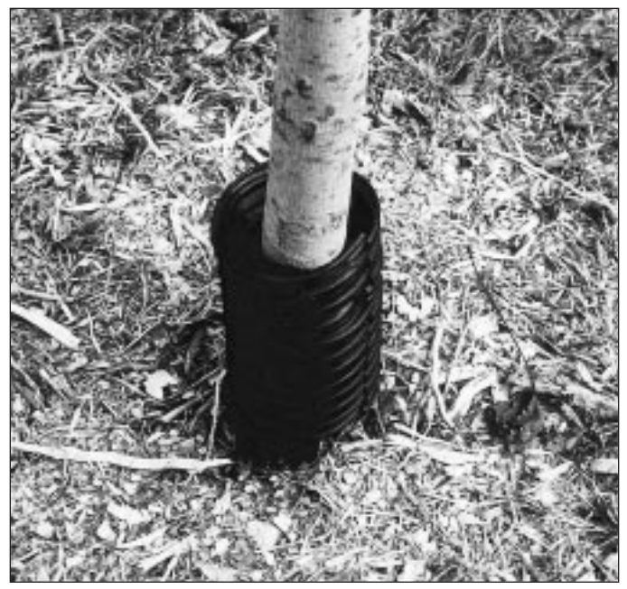
Field tile protects trees from weather, small mammals and equipment. White field tiles are preferrable to black.

Note: The mention of trade names of products is for the convenience of the reader and does not constitute endorsement of a particular product by the Ministry of Natural Resources to the exclusion of any other suitable product.