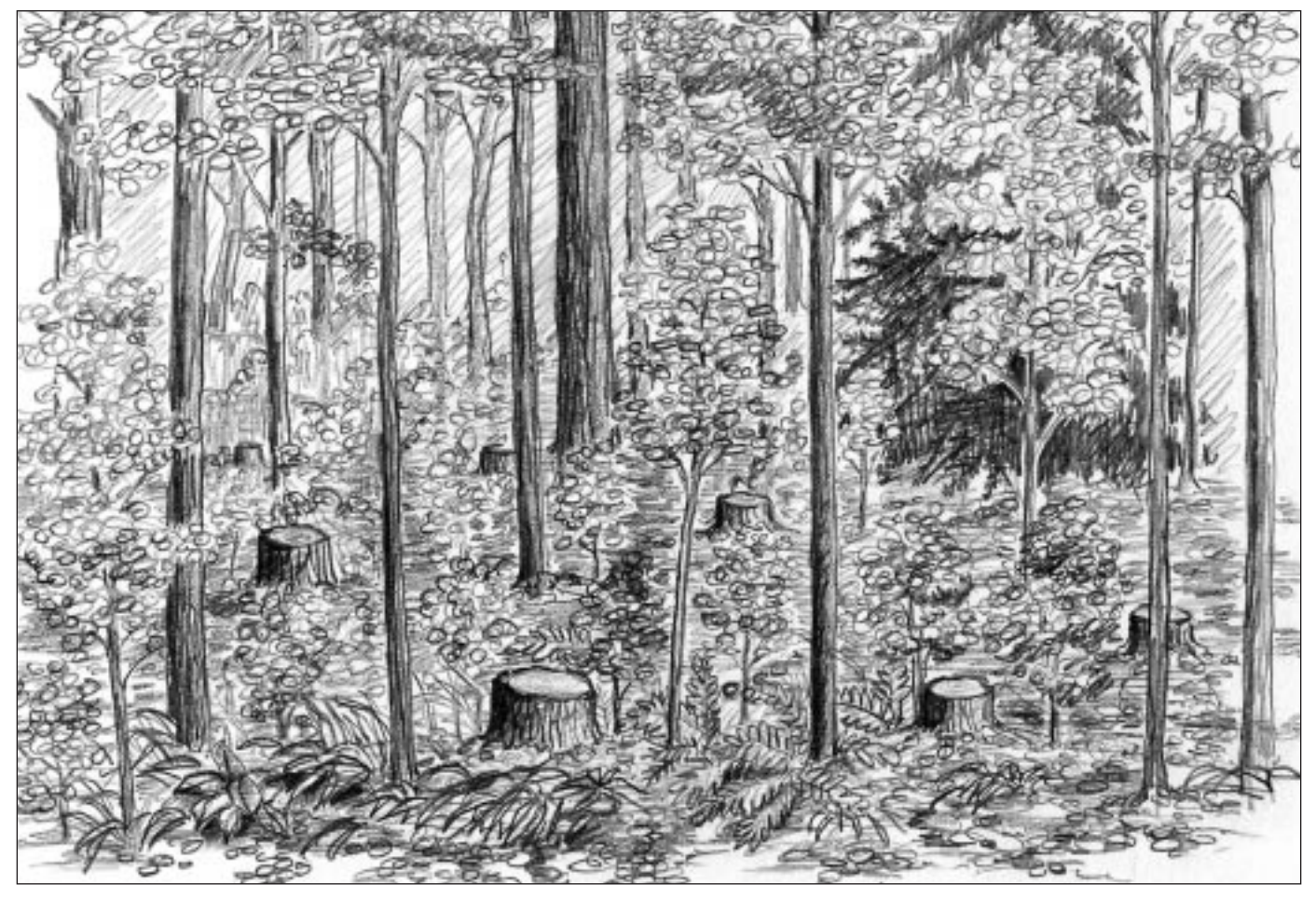
The selection management system maintains a diverse, all-aged forest with a wide range of species of different sizes and ages.