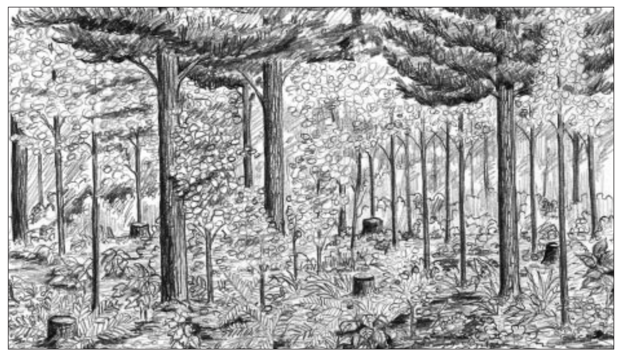
The shelterwood system maintains a forest canopy to protect, shade and shelter a new crop of trees.