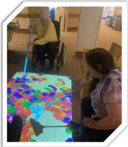
The OBIE in action!

In March, we look forward to having our Breakfast clubs back, Marsh View will be March 2nd, Creek view will be on March 9 th , Bridge View will be on March 16th and Hill View will be on March 21 st . We will also be celebrating St. Patrick's Day on March 17 th